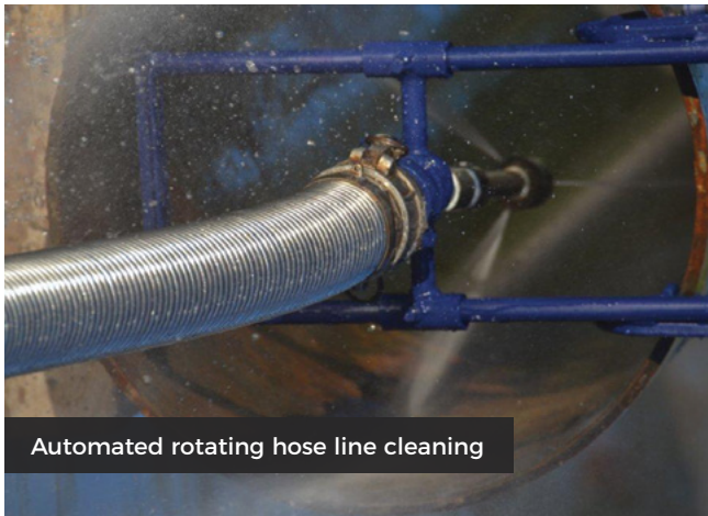
Automated rotating hose line cleaning