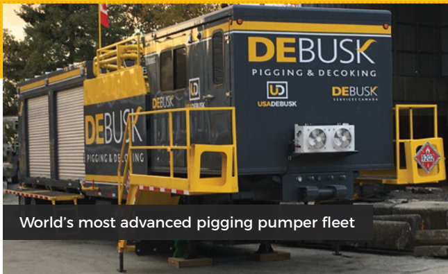
World's most advanced pigging pumper fleet